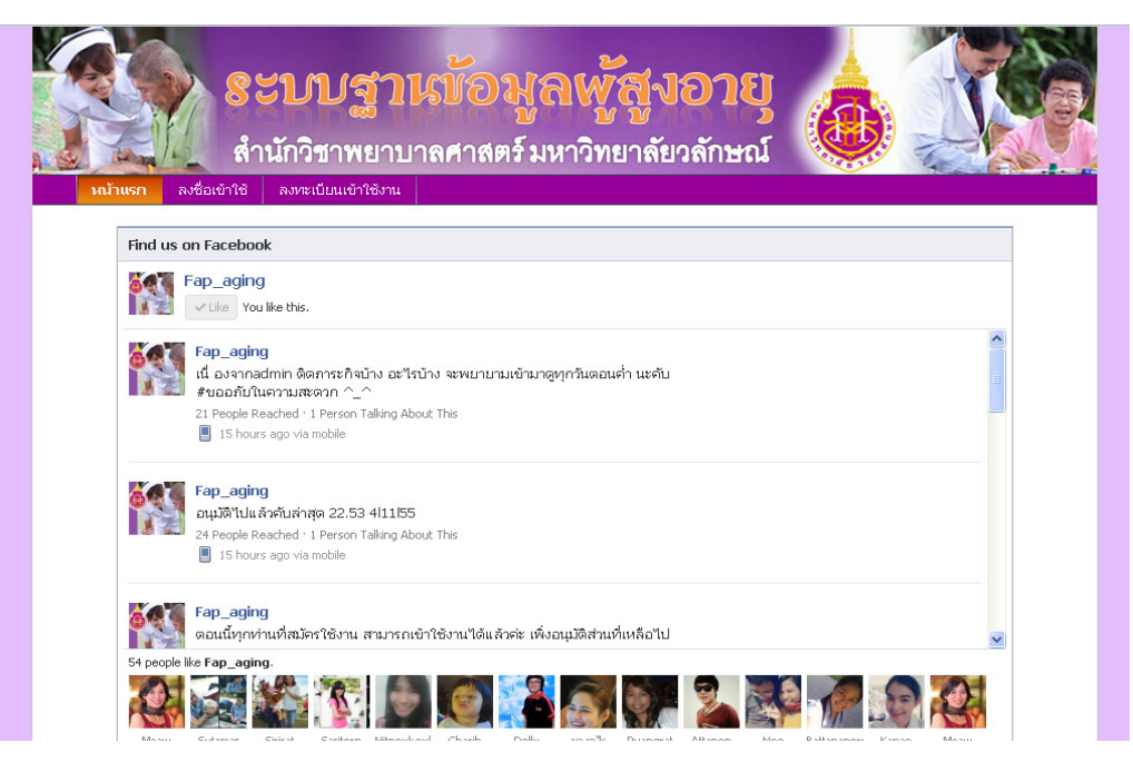
Figure 1 Home page of the database system providing access method and user listed in Facebook account with their thumbnail profile picture.

The system was designed to be used by three user groups: 1) system administrators, actioned as managed users and those who solved incorrect data entry by users; 2) data entry users, actioned as inputting data into the system, and 3) general users, actioned as reporting all data based on their privileges. Users could access the database system by logging into the system, though users who did not log in did not have access to any information or reports. For security reasons, the login system required a username and password, only obtainable from the system administrator. The Facebook page, FAP_aging at URL: https://www.facebook.com/fapaging, was used to coordinate, advise, and solve problems for users. Since March 2014, a prototype database system has been available online at URL: http://fapaging.welfarepakpoon.org (Figure 1). At present, the database system contains data from 908 older adults, in twelve communities. Following the login, the user could choose two main functions: older adult data entry and user management.